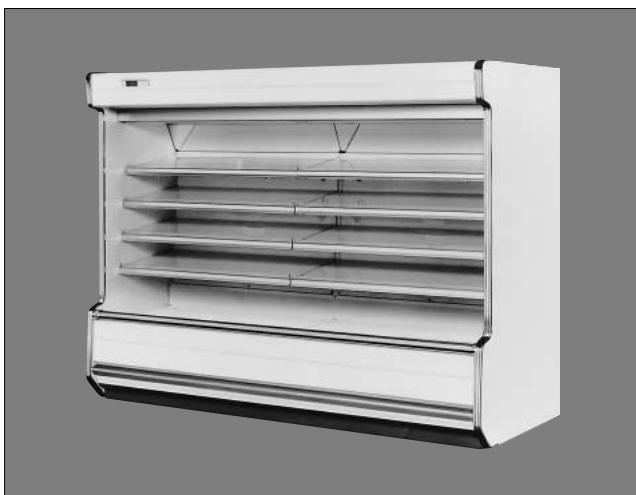
Fig. 1 External view of the multi-deck open refrigerating display case for frozen food

Cooled air with high specific gravity has a marked tendency to flow in the direction of gravity. This tendency is particularly strong in the air curtains of multi-deck open refrigerating display cases used for the lowest temperature range. The non-alignment of the nozzles of exhaust and inlets is a serious disadvan-