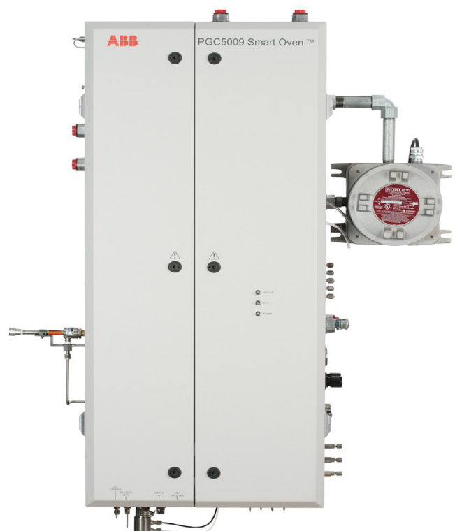
The PGC5009 fast gas chromatograph

The separation of components and products in a refinery is mostly done by distillation columns. To maintain profitability it is important to have good distillation control, which is only possible by using analyzers that quickly respond to compositional changes. The PGC5009 uniquely provides the fast and repeatable measurements needed to implement tight control strategies that improve margins.