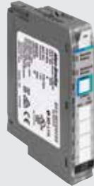
1734 POINT IO Master for POINT I/O™